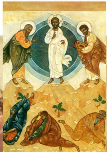
Transfiguration of Our Lord